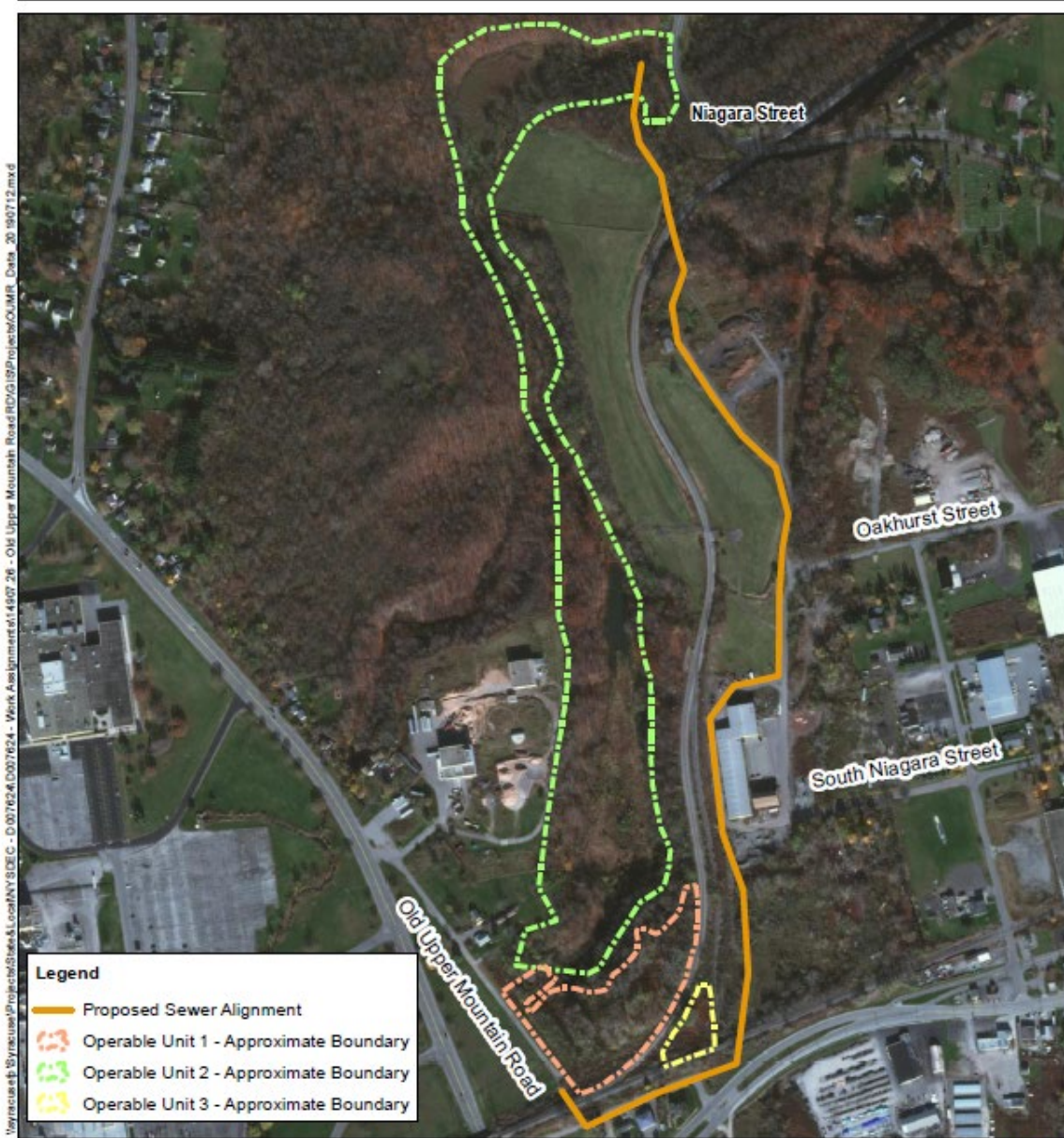
Figure 1 Old Upper Mountain Road Site Old Upper Mountain Road (932112) Lockport, New York