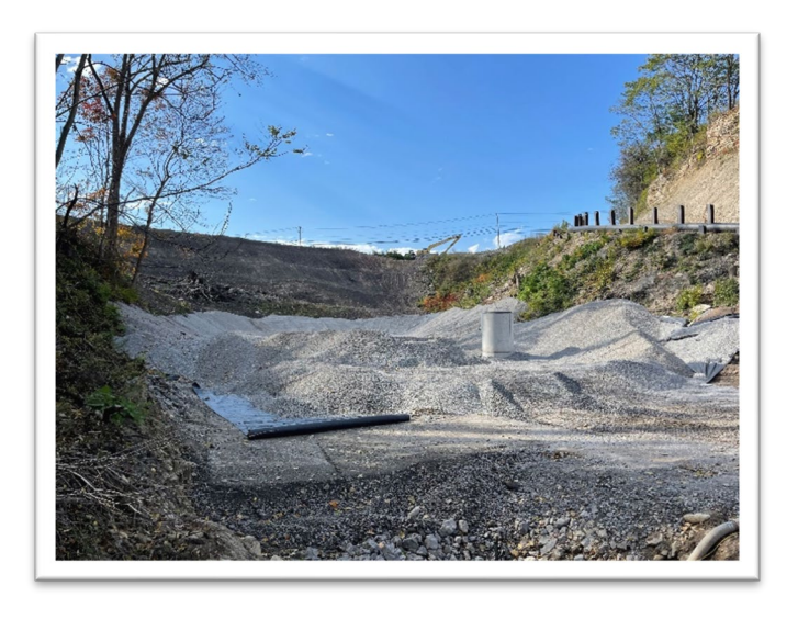
Footprint of future containment cell, October 2023

Various green remediation best management practices are implemented to reduce the environmental footprint of cleanup activities, including: