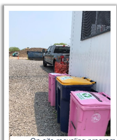
On-site recycling program

Relocation project; approximately 10,000 gallons of treated site water utilized for equipment