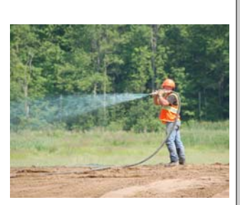
Hydroseeding practices reduce erosion & sedimentation