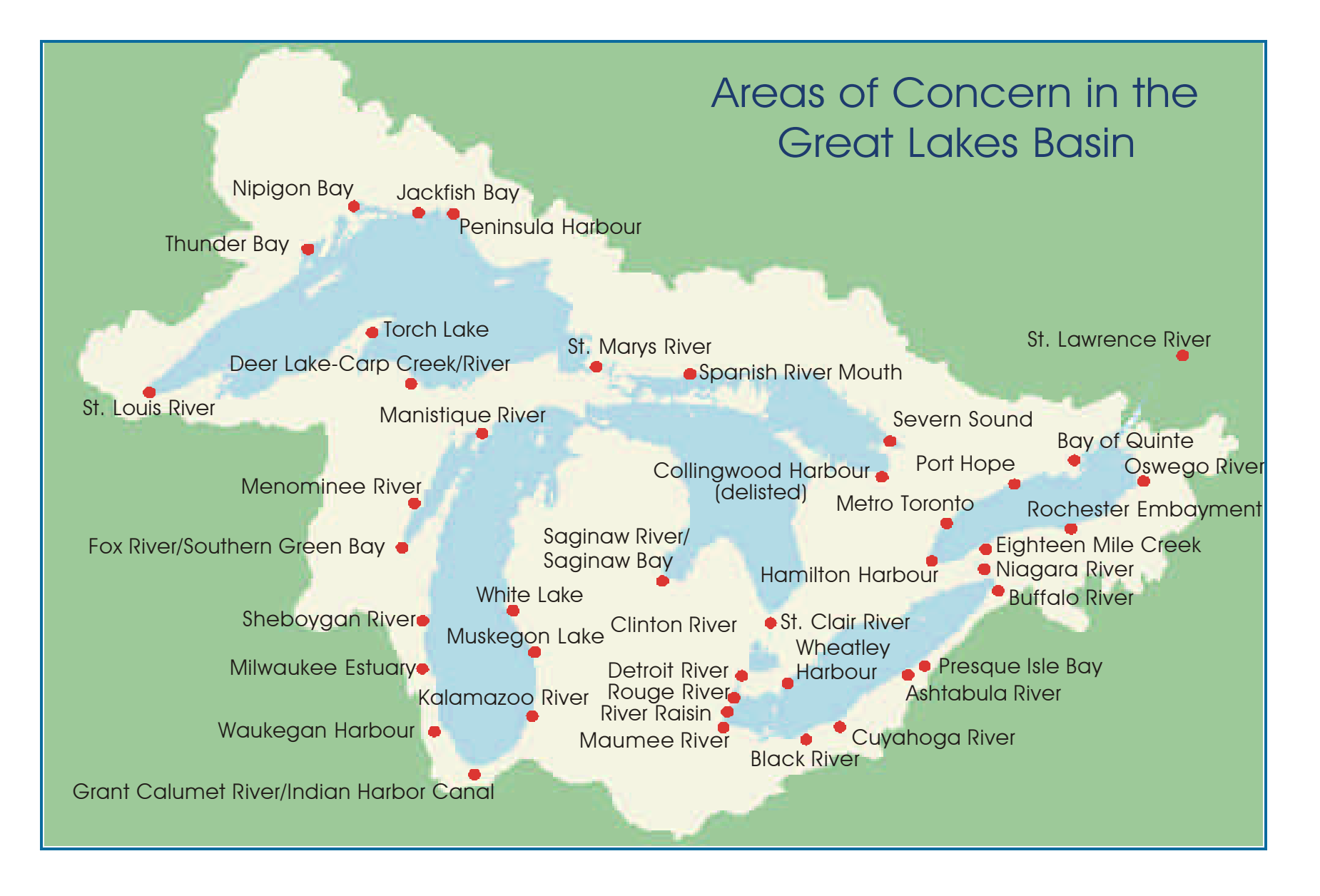
Figure 1. Locations of 43 Great Lakes Areas of Concern.